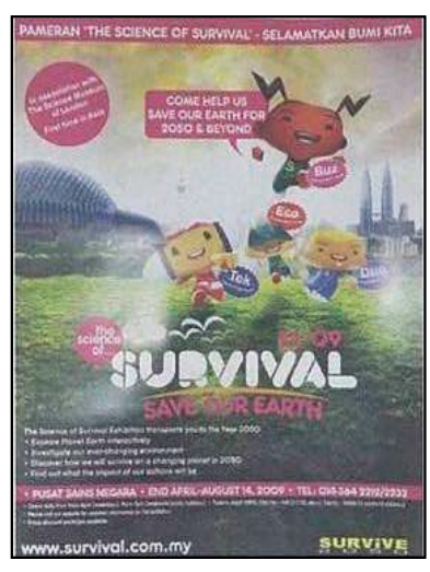
THE SCIENCE OF SURVIVAL – 2010 FROM LONDON SCIENCE MUSEUM