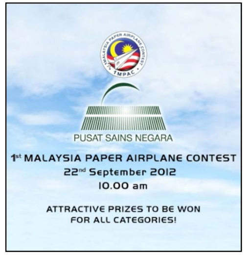
PAPER AIRPLANE CONTEST 2014