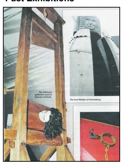
TORTURA – 2003 & 2011 FROM ITALY