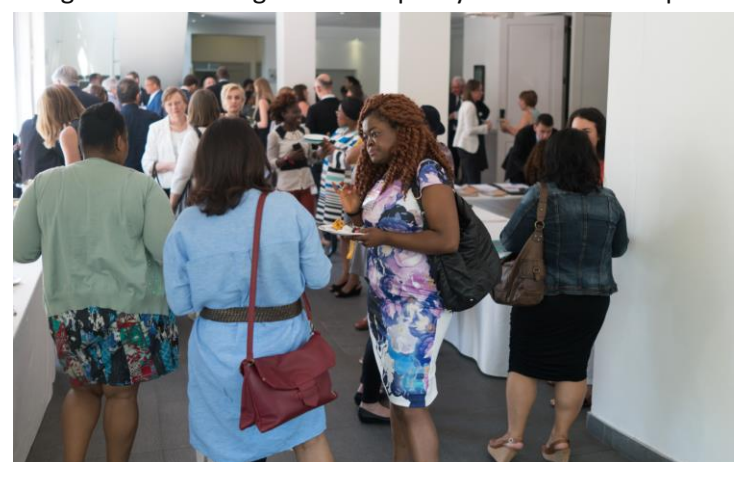
Conversations continued during the breaks

The best research and health information about the African continent currently exists in a closed feedback loop that mainly feeds the health sector and, due to limits in dissemination through peer reviewed or grey literature publications, it is not used often enough to inform policy. Platforms that bring researchers together with policy makers and the public are required, and in this regard,