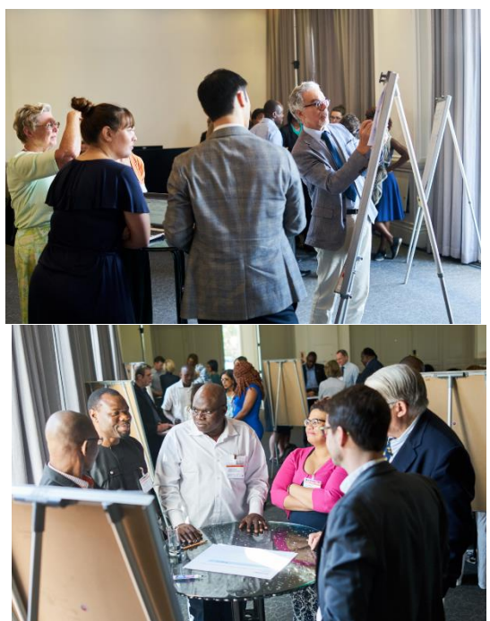
Event participants engaging in interactive World Café Small Group Discussions