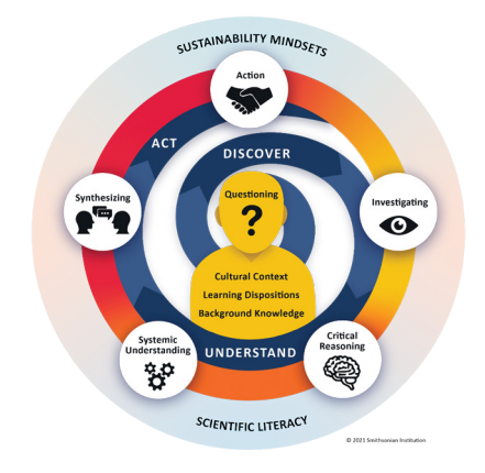
Figure 2: Global Goals Action Progression.

Gathering new information is a primary goal of science. Using a wide variety of methods to do so helps young people understand the problems related to sustainable communities. They need to understand the problems both abstractly and within the context of their local community. Designing and conducting real-world investigations and interpreting results encourages young people to think like scientists.