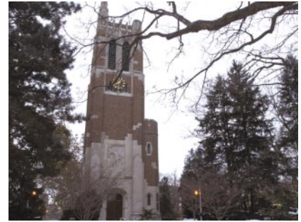
Michigan State University is among the institutions set to lose biotechnology funding.

budget, administered by the Michigan Economic Development Corporation, has gone to fund basic research at public institutions such as Michigan State University, with the rest helping private start-up companies or public-private collaborations.